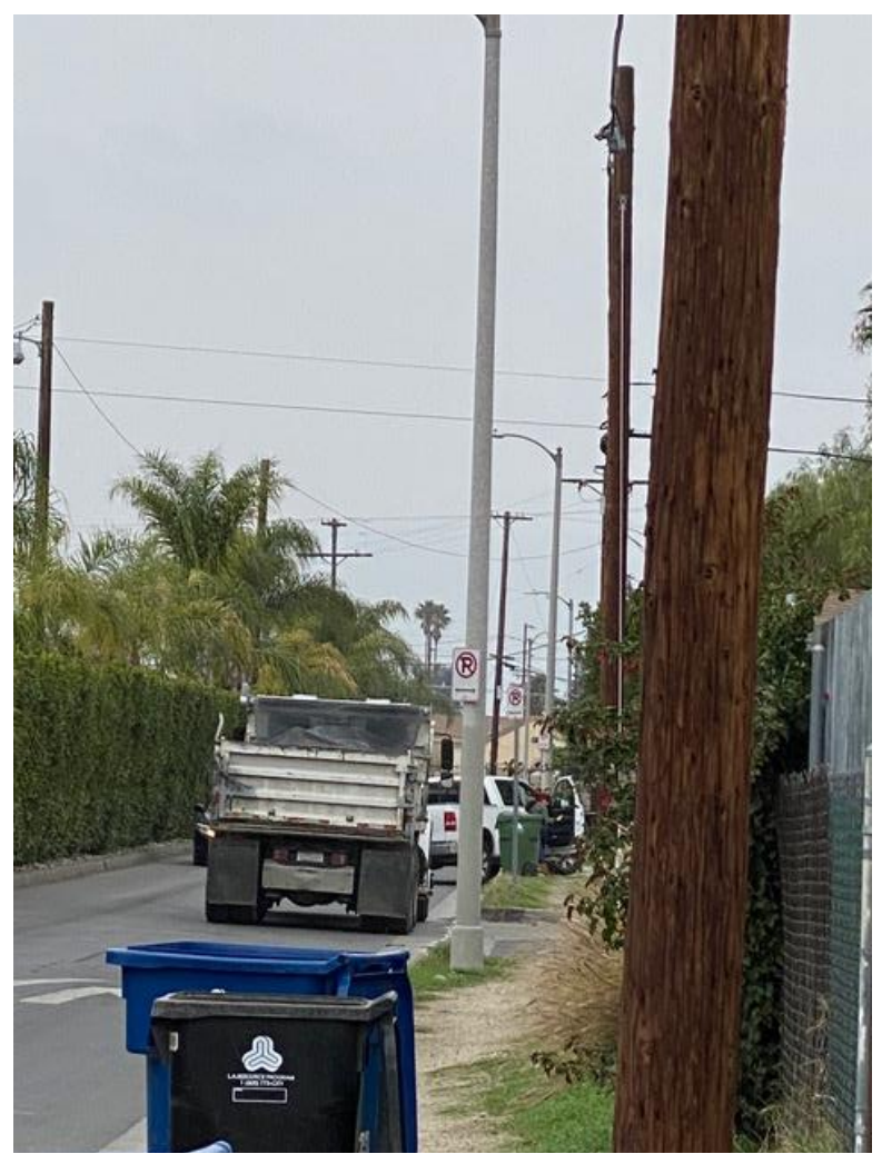
LAT 11 https://www.svanc.com/archives/agendadocs/2023/04/LAT-11.jpeg