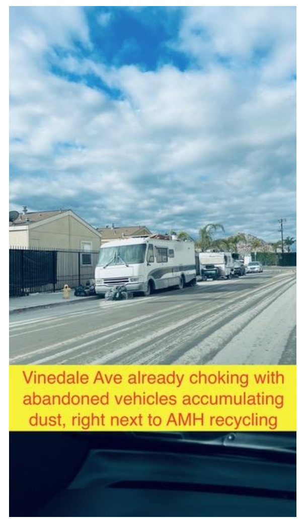
Vinedale choked by RVs https://www.svanc.com/archives/agendadocs/2023/04/Vinedale-choked-by-RVs.jpeg