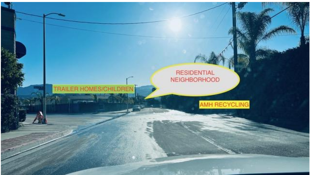
To Show Distance https://www.svanc.com/archives/agendadocs/2023/04/Distance.jpeg