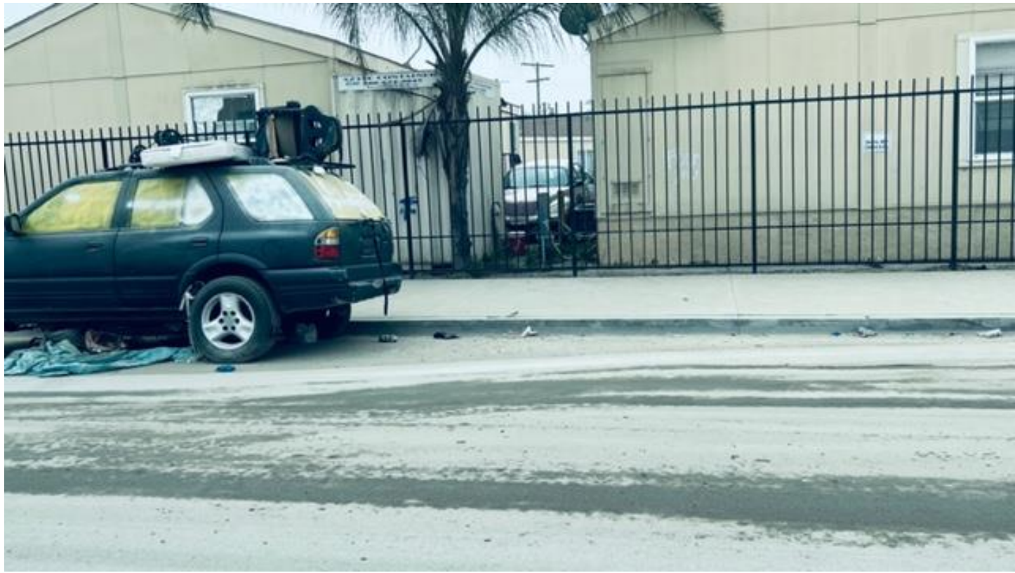
LAT 5 https://www.svanc.com/archives/agendadocs/2023/04/LAT-5.jpeg